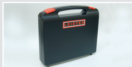
Included in delivery: storage case with spare O-rings