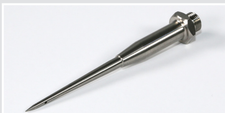
Not included in delivery: Spare needle Article no.: 150.142